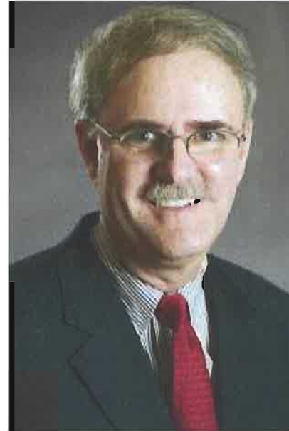
Candidate for New Jersey General Assembly, District 39